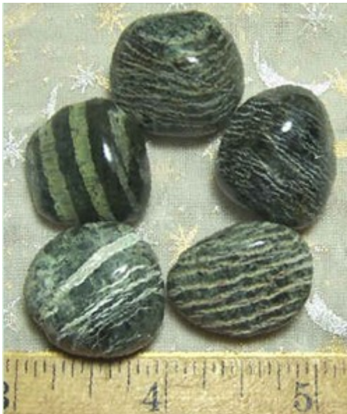
serpentine with chrysotile