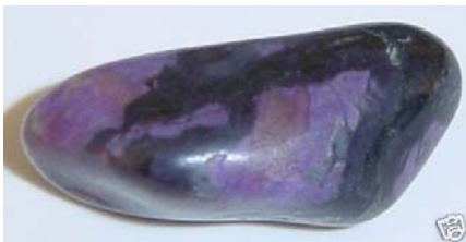
sugilite with pyrolucite