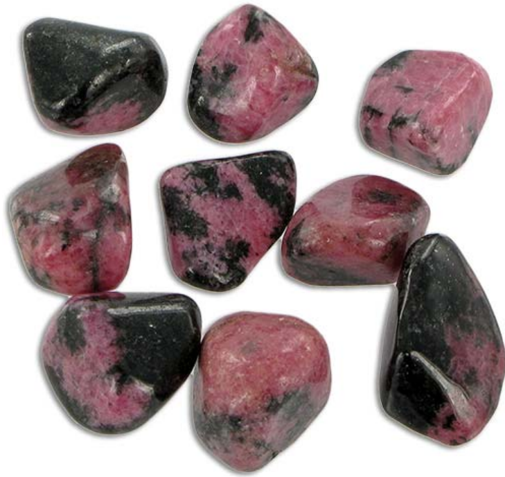
rhodonite with manganese oxide