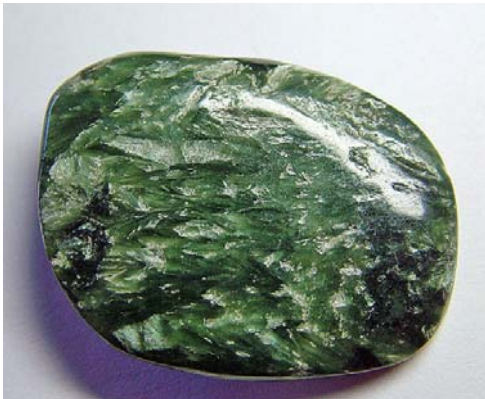
seraphinite - is a trade name for a particular form of clinochlore, a member of the chlorite group.